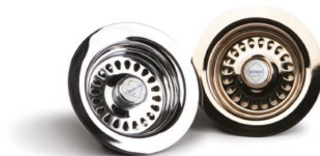
Shown here in Chrome and Gold.

Available in an array of Colours matching Nicolazzi Tapware. Standard finishes are Chrome | Gold | Nickel | Antique Bronze